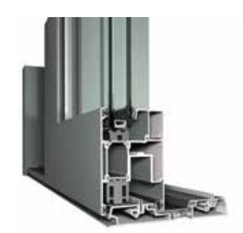
CP 155-LS/HI low treshold