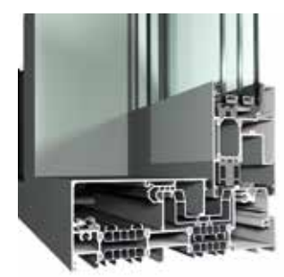
CP 155-LS/HI with Minergie label